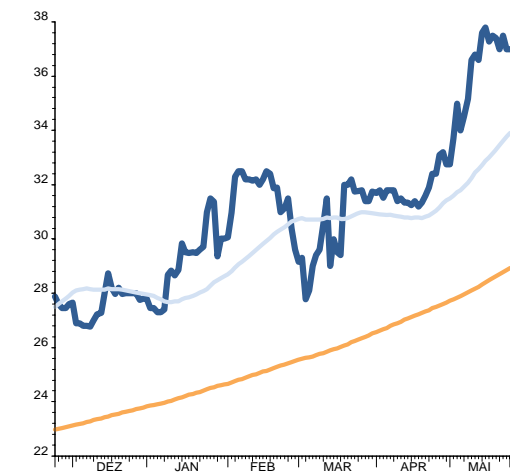
— 38D Moving Average — 200D Moving Average